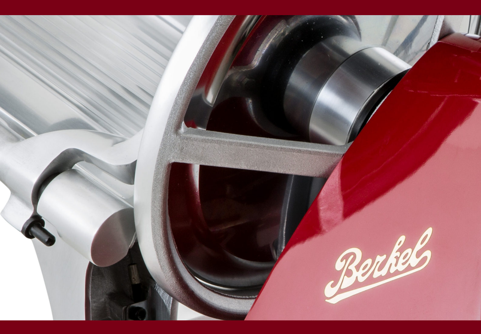
"The quality of a professional slicing experience."